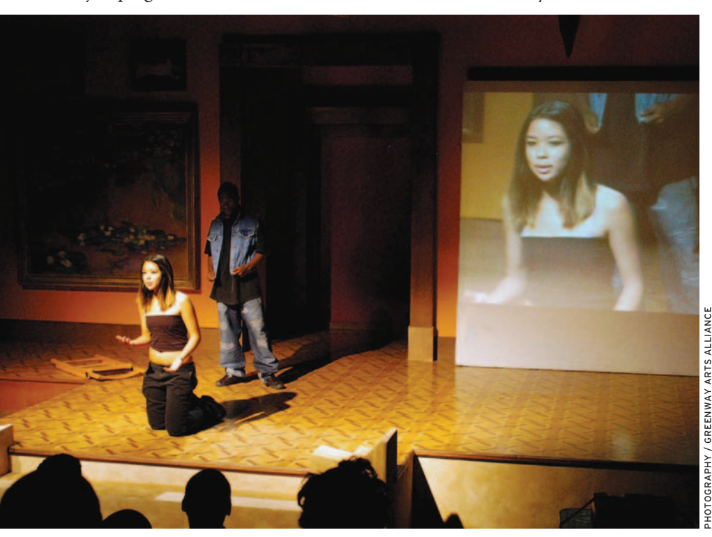
Students at Fairfax High School in West Hollywood stage a multimedia production at the Greenway Court Theatre.

It helped, too, that the initiative gave 2,000 actors in 77 theater companies employment, and that Gioia was able to fund the Shakespeare project without taking any funds away from existing theater grant categories. Moreover, the Arts Endowment's allocation from Congress grew steadily, jumping $20 million from 2007 to 2008 alone. Even if they