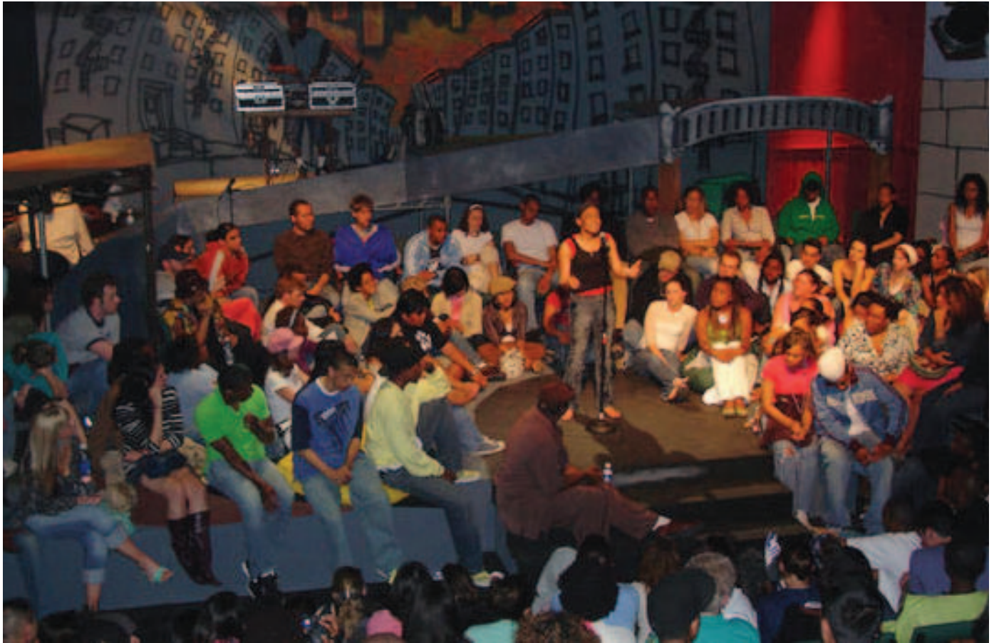
Greenway's weekly poetry lounge is one of the most popular slam events in the country.

in various productions after school, and their weekly Poetry Lounge is one of the most popular slam events in the country. While Greenway's curriculum emphasizes its work with "at-risk high school students" and the power of the arts to "motivate youth" and impart "essential life skills," it also aims at "skills, knowledge, and/or understanding of the arts consistent with national and state arts education standards." In other words, while nodding to the social benefits of the program, Greenway recognizes the bottom line: demonstrated learning of the art, history, and practice of theater itself.